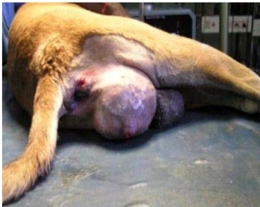
Figure 1:Hernia Disease 2

Hernia disease has been a major issue in the field of surgical research where the internal tissues would protrude through the weakened abdominal walls and effective and long-lasting repair techniques would be required 1 . The management of hernias has over the years also become innovative, as the traditional methods of surgical practice by the use of open surgical interventions has been replaced by improved methods of minimally invasive and robotic-assisted surgery, involving innovation in surgical practice and biomedical engineering. In this regard, animal research has been of critical importance in the advancement of knowledge in the study of anatomy structure, tissue recovery process, and the functionality of several biomaterials employed in reconstruction. Rodents, rabbits, pigs, and canines are also experimental models that can be used to examine mesh incorporation, inflammatory phenomenon, collagen organization, and biomechanical strength in controlled settings, which can be used to systematically assess various repair options and technologies.